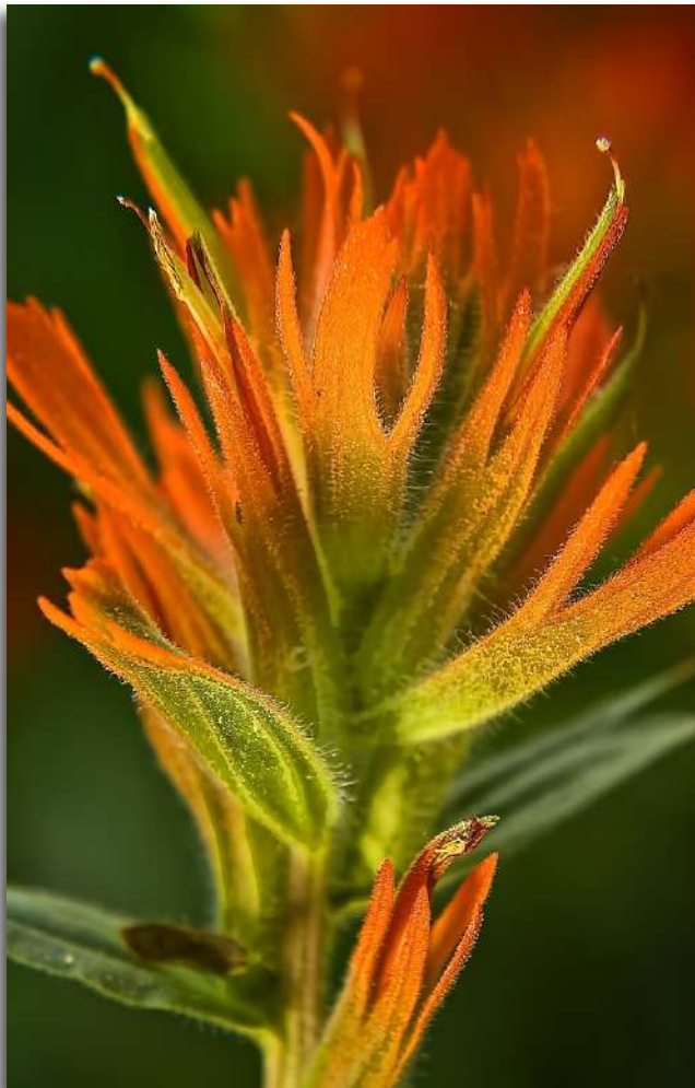
HM "Indian Paint Brush" Jared Ikeda